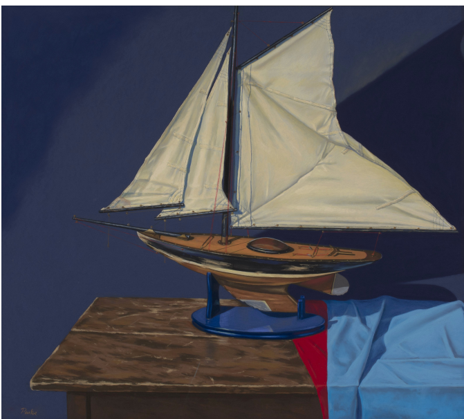
old toy sloop

Tim Parks' PSA-MP, PSME pastel painting, "Old Toy Sloop", 32" x 36" was included in the winter edition of The Pastel Society of America's magazine, "PASTELAGRAM".