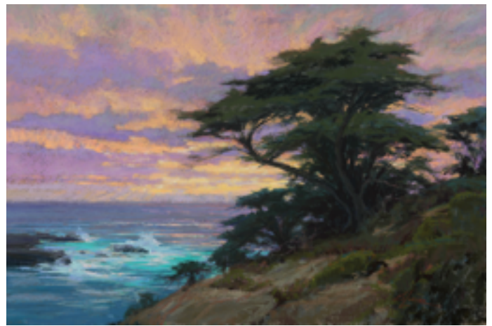
A Day of Grace, Pt. Lobos