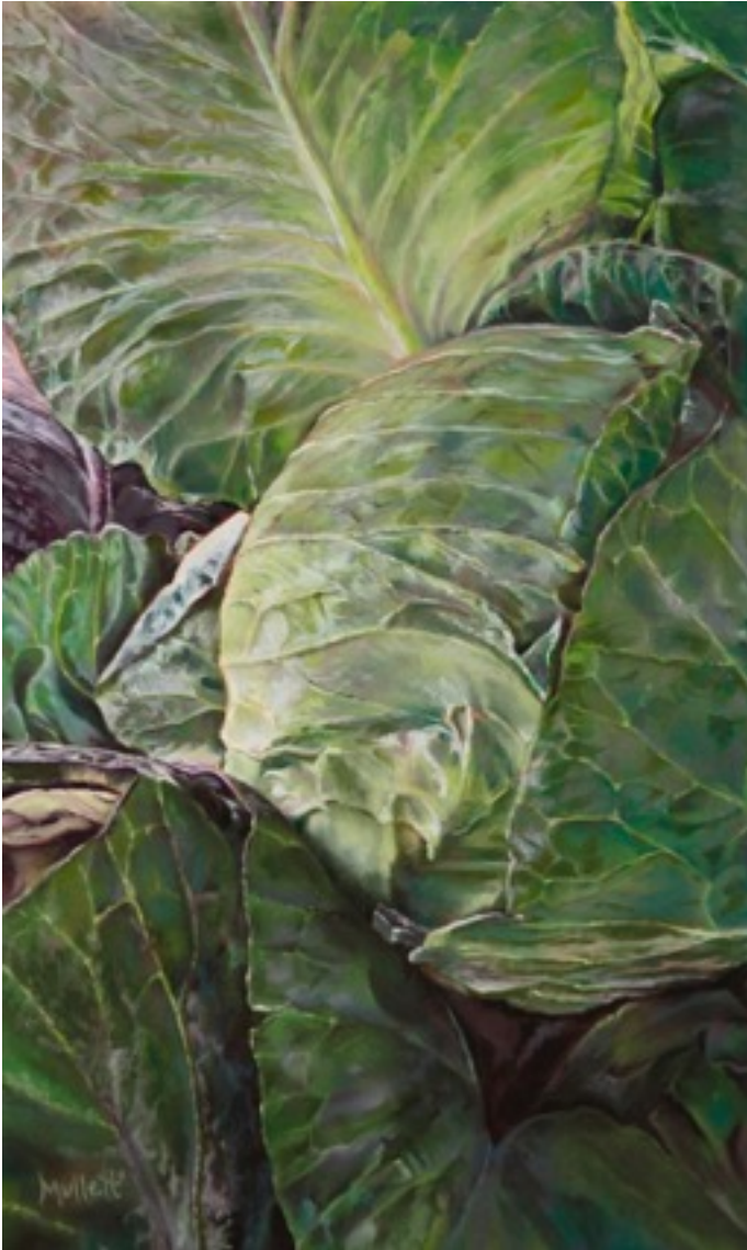
Before The Slaw