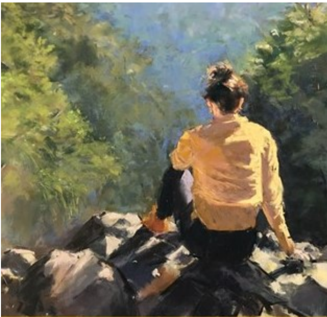
2019 Best in Show – Lost in Thought by Tamara Amoroso