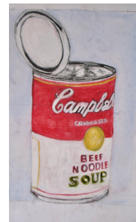
Famous Still Life Challenge