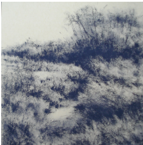
Monochromatic terpenoid underpainting

Underpaintings can help solidify the composition's abstract shapes, establish accurate placement of light and dark values, and set the painting up for luminosity, while freeing you up to concentrate on what you really want to paint. Embrace the serendipity that underpaintings can offer and allow your intuitive side to shine. We will work with a variety of underpainting materials and techniques to explore how underpaintings can expand the creative potential in your work.